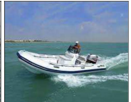
Boarding - Disembarking